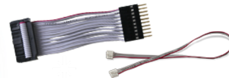
TI-Innovator™ Rover, Breadboard Ribbon Cable and I 2 C Cable