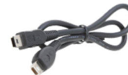
USB unit-to-unit cable