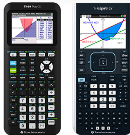
TI-84 Plus CE graphing calculator or TI-Nspire™ CX handheld