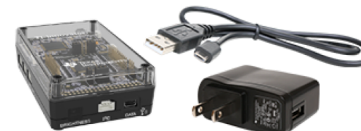
TI-Innovator™ Hub with TI LaunchPad™ Board power cable and wall adapter